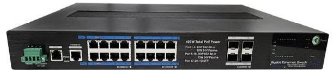
TP-SW16GBT/AT/PSV-U Industrial PoE Switch